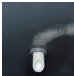
Clockwise from top: a) installation of injection quill in flanged port b) flange injector sandwiched between piping flanges c) internal view of a Teflon quill inside pipeline.

Our Teflon injector is suitable for concentrated sulfuric acid injection. Teflon is capable of resisting all concentrations of this aggressive chemical at the elevated temperatures commonly found during acid dilution processes.